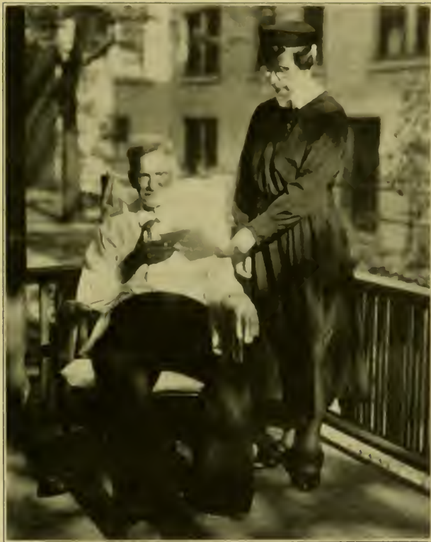
Reading to the Shut-ins